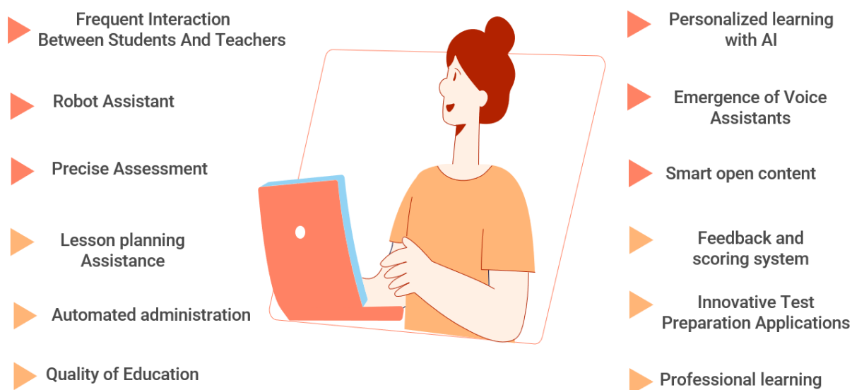
Figure 1. Benefits of AI in Higher Education.